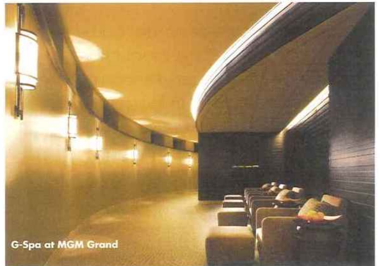
G-Spa at MGM Grand

Get a fresh new look to greet the season. New advances in wrinkle-smoothing technology, Thai foot massage, and a glamorous, girly new salon will put spring in your step.