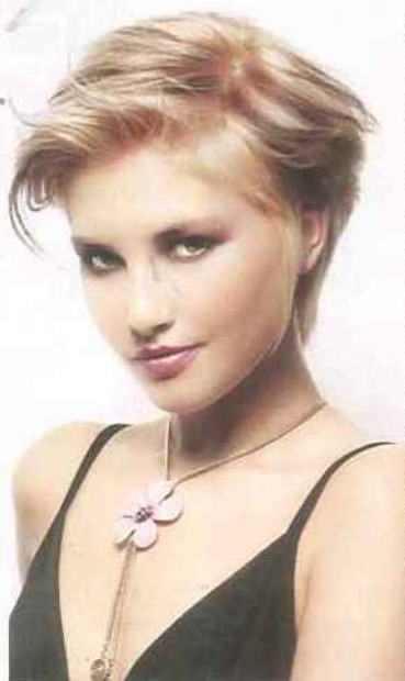
Short, tousled hair can make you look years younger.