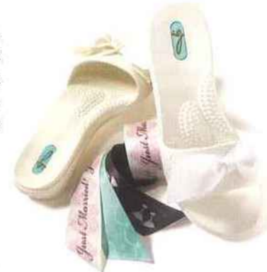
Pictured top is the "Juliet". Pictured above is the "Madison". Pictured left is the "Bella".